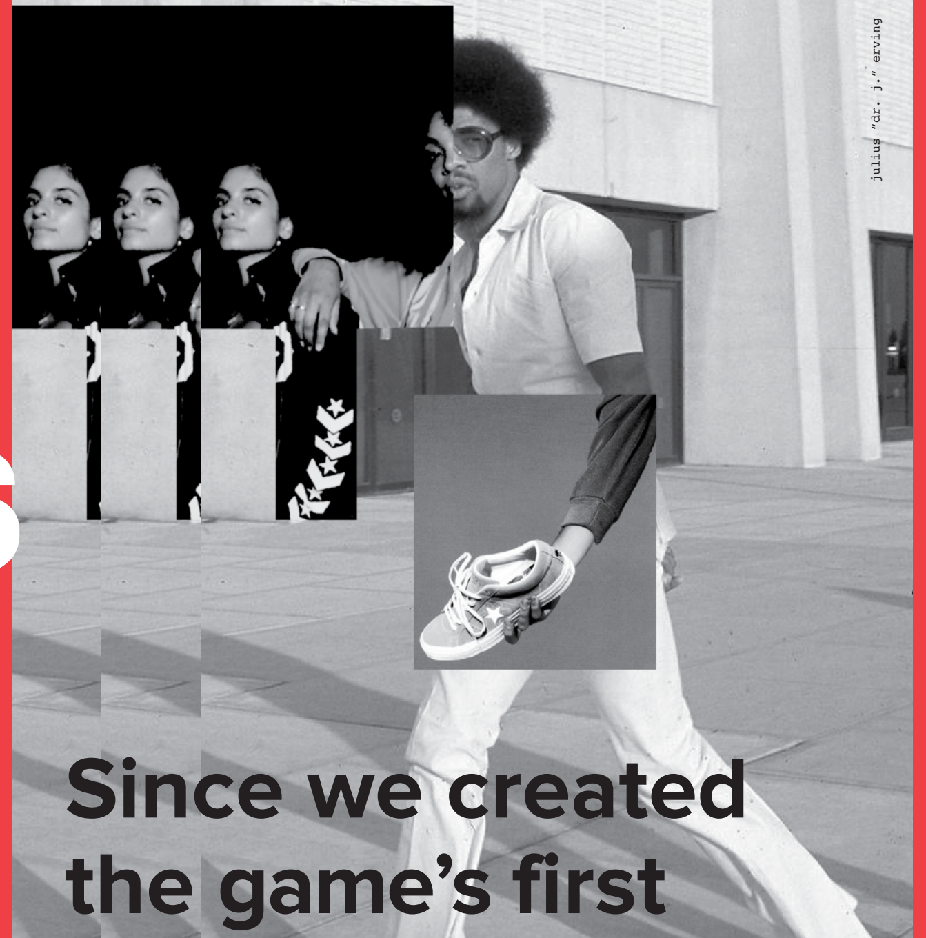
julius "dr. j." erving

Since we created the game's first shoe, we've been a part of movements in music, sport and culture.